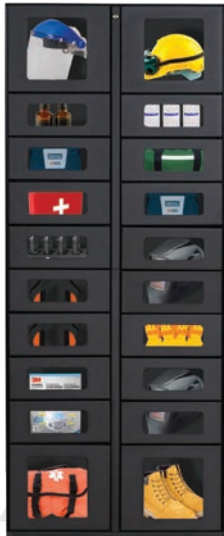
Adjustable Locker Satellite