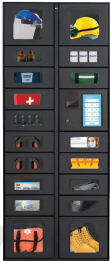
Adjustable Locker Host