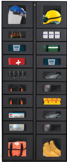
Adjustable Locker Satellite