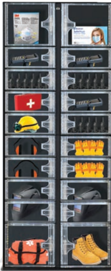
Adjustable Locker Satellite