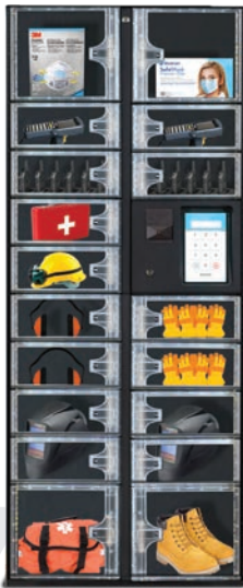
Adjustable Locker Host